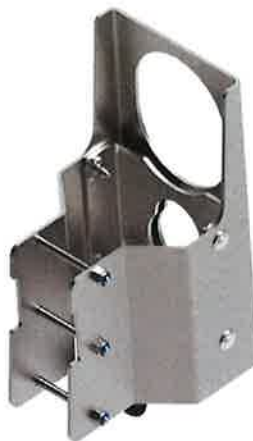
Fig. 3: Retaining bracket, type: retaining bracket IKAR 41-HRA 12E and retractable type fall arrester with rescue lifting device, type: IKAR HRA 12