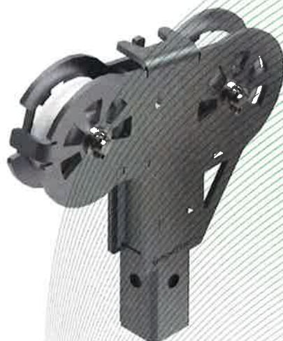
Fig. 4: Pulleys / Rescue attachment ZB